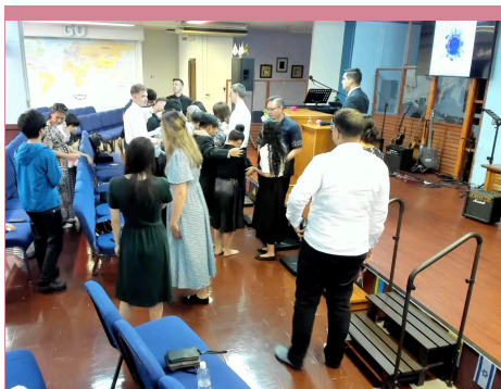
Praying for the youth at a Youth Service