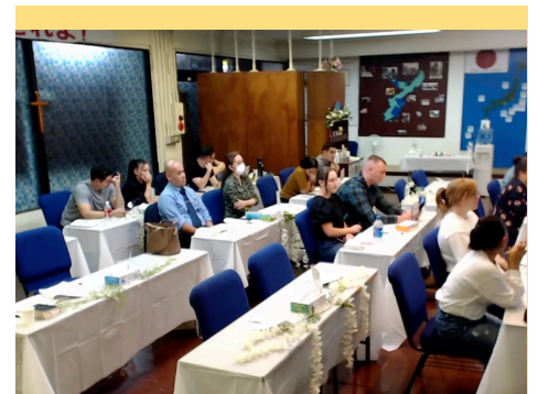
Some of the couples that attended the Marriage Seminar