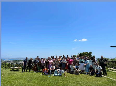
AYC group photo at Hacksaw Ridge

and go to an observation point at night to overlook the city and pray. Second largest city in Japan and we do not have an established church in this city yet. We do have a couple of preaching points but we are in need of someone to catch a burden and go. Last day in Japan we took a tour bus to the ancient city of Kyoto to see the sights and enjoy some sightseeing. Wrapping the whole trip up with an amazing final meal together with a buffet in the hotel. Here we all shared great testimonies of how much this event impacted all of our lives. What a blessing!