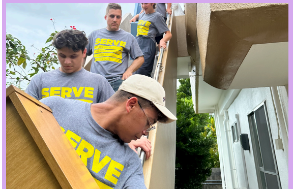
Left: AYC group during a regional Youth Service Above: AYC group working so very hard at moving a local church in Nago City in Okinawa

What an awesome God we serve! This month started out with us hosting an AYC group of 48 wonderful Christians. First we thought a typhoon was going to redirect our plans but God moved the typhoon out of the way. We rented 6 vans and was able to meet daily for devotions in our main campus. From there we did prayer drives on the island of Okinawa. North, South, East and West. This group was such a blessing and helped with testimonies and support to 5 different established churches for Sunday services in Okinawa, a Youth Rally and street worship