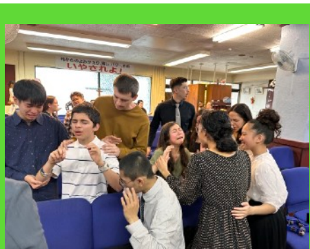
Amazing move of God at an end of Service

Prayer meetings, and Daily Devotionals. We seem to be growing an audience from all over the world! The month of February we are planning a special Men and Women Fellowship on our Life Connections Weekend. Also that weekend we encourage our daughter churches to attend for fellowship and potluck. The work in Miyako Island seems to be doing well. This last Sunday we had 4 different language groups attending. English, Japanese, Polish and Tagalog. We are planning on a Holy Ghost rally here in February .