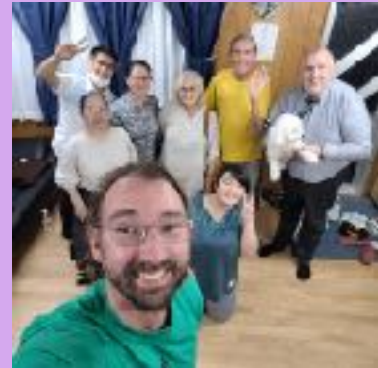
Left: Japanese Youth baptized in Jesus name. One week earlier he got filled with the Holy Ghost. Above: Small group meeting in Miyako Island

We are working in both Okinawa and Miyako islands. This month we were hit with yet another typhoon in Miyako Island. There was not much damage as in the previous typhoon. However the food supply is always delayed as food is shipped in and these ships do not come to these islands during typhoons. This typhoon did not interrupt us. In fact it seems we are having more determination to gather together for prayer and for bible studies and fellowship! We are seeing amazing results with the youth in the Uruma city campus. So thankful for Aimer