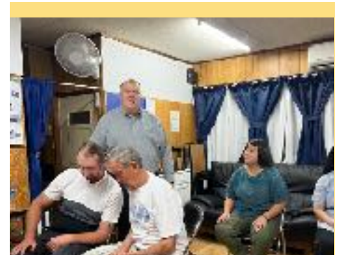
Praying for the church members in Miyako.