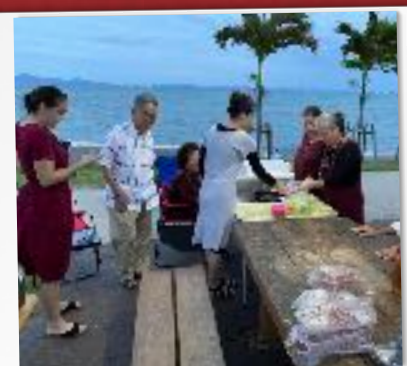
BBQ WITH MY FAMILY. REACHING OUT TO THE IN-LAWS