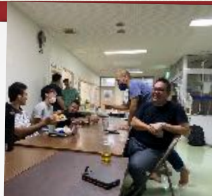
MENS MEETING AND FELLOWSHIP