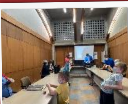
PREACHING POINT SERVICE IN NAGO CITY